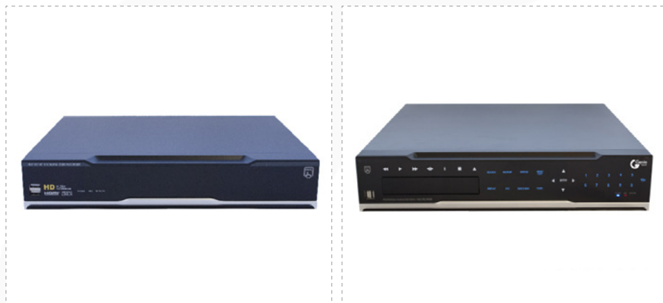
HYHDVR4 & HYHDVR8