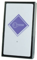
IP65 External Reader EUR-061