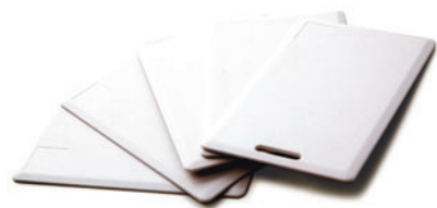
Set /Unset Cards (pack of 5) EUR-024