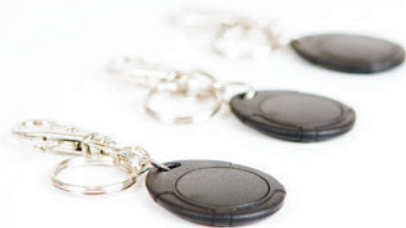
Set /Unset Fob (pack of 5) EUR-023