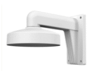
HIA-B402-130T Wall Mount