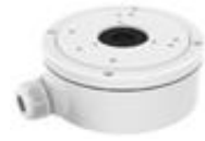
HIA-J103 Junction Box