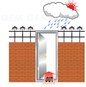
The EXM12-24 is constructed in a stainless steel case and if fully potted for use in outdoor applications.