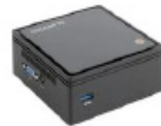
Mini Form Factor Windows PC