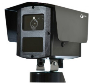
Genie ANPR Camera

Each unit is pre-calibrated and tested for simple installation and a unique cabling and power supply system ensures a no risk simple installation minimizing time spent on site.