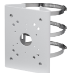
PFA150 Pole mount