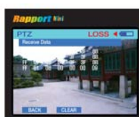
PTZ Protocol Analyser