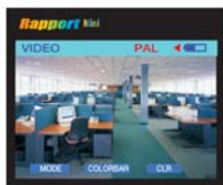
CCTV Field Monitor

RAPMIN Rapport Mini Multifunctional CCTV Tester