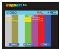
Video Signal Generator