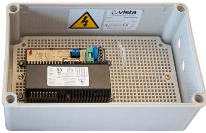
VPSU1221EXTe & VPSU1241EXTe