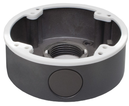
WIPJBBVG (Grey seals are available)