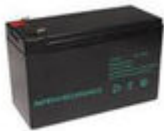
F02337 BATTERY 12V 7Ah