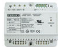
F04813 P.S.U. DIN6 100-240VAC/12VDC-2A