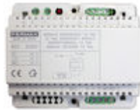
F02060 BATTERY ADAPTOR 12 V