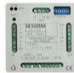
F04420 DOOR CONTROLLER